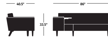
Flop Sofa—Utility Arm and Adjustable Table

These drawings represent a sample of the dimensions and configurations available. Download the price book for a full listing of all available product configurations.