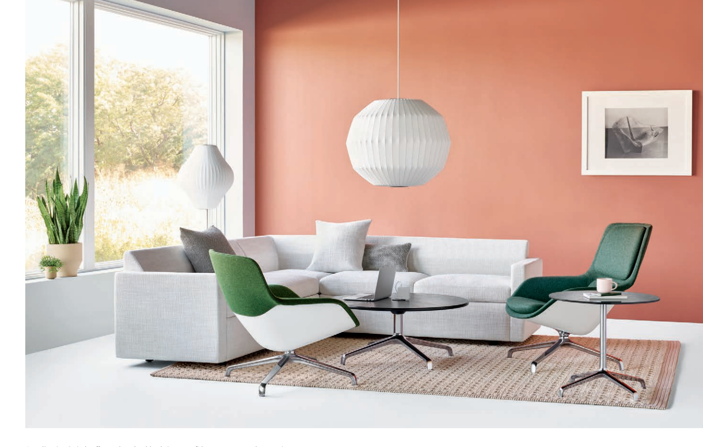
Coordinating Striad coffee and work tables bring a confident presence and convenient power access to a variety of work settings.