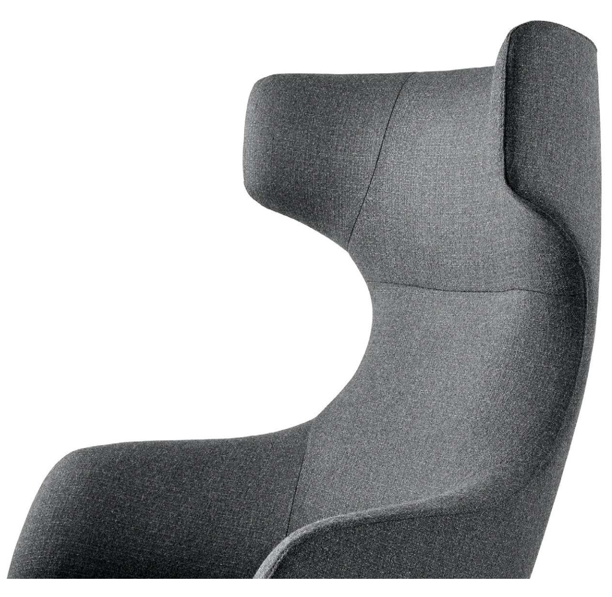
The wing-back \ chair is \ designed \ to \ be \ closed \ and \ protective \ and \ limit \ peripheral \ distractions.

Reframe Lounge Chairs are available in three back heights. Low and open, the mid-back is designed to encourage conversation. The high-back offers a bit more support, while the wing-back goes even further, almost wrapping the sitter to encourage focus and limit peripheral distractions. Used thoughtfully across an office landscape, the Reframe family allows workers to choose the chair that suits the task at hand.