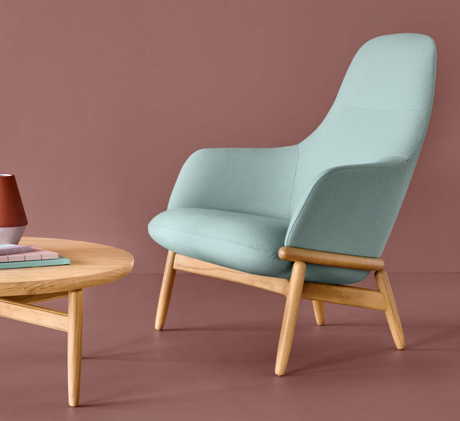
Designed by EOOS for Geiger®