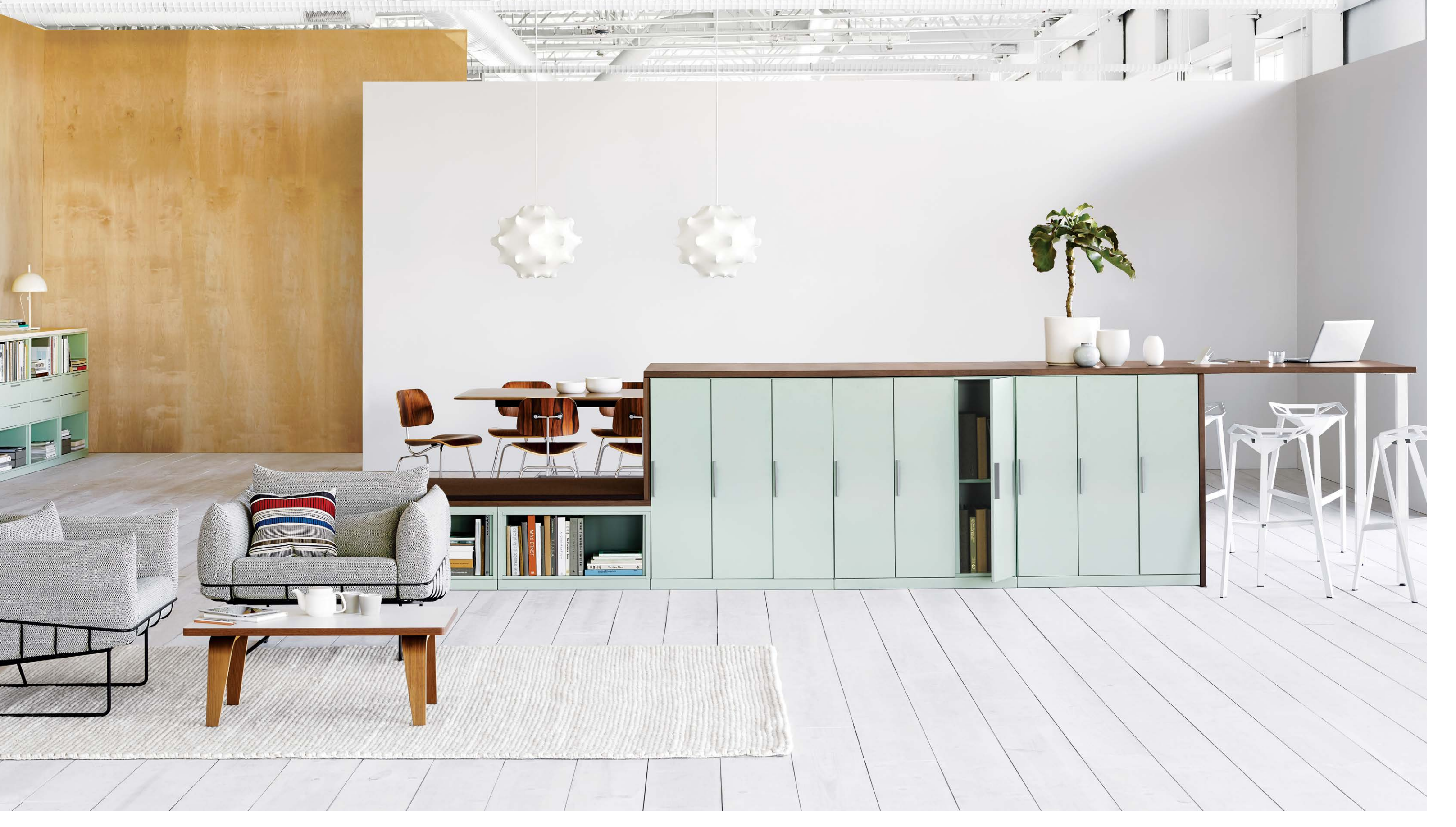
A place for everything