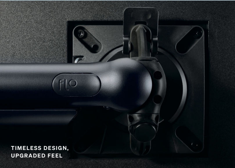
TIMELESS DESIGN, UPGRADED FEEL

Installing Flo is simple, either by hand or by using the tool provided. With its integrated weight gauge providing an instant visual guide, finding the correct setting couldn't be easier, no matter the type of screen you're using. Fine tune your installation with the adjuster for an even more accurate ergonomic set up.