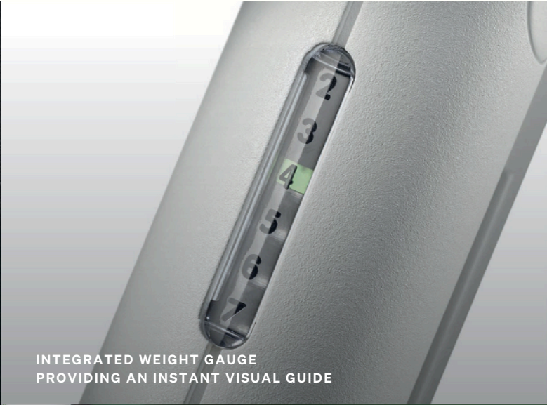
INTEGRATED WEIGHT GAUGE PROVIDING AN INSTANT VISUAL GUIDE