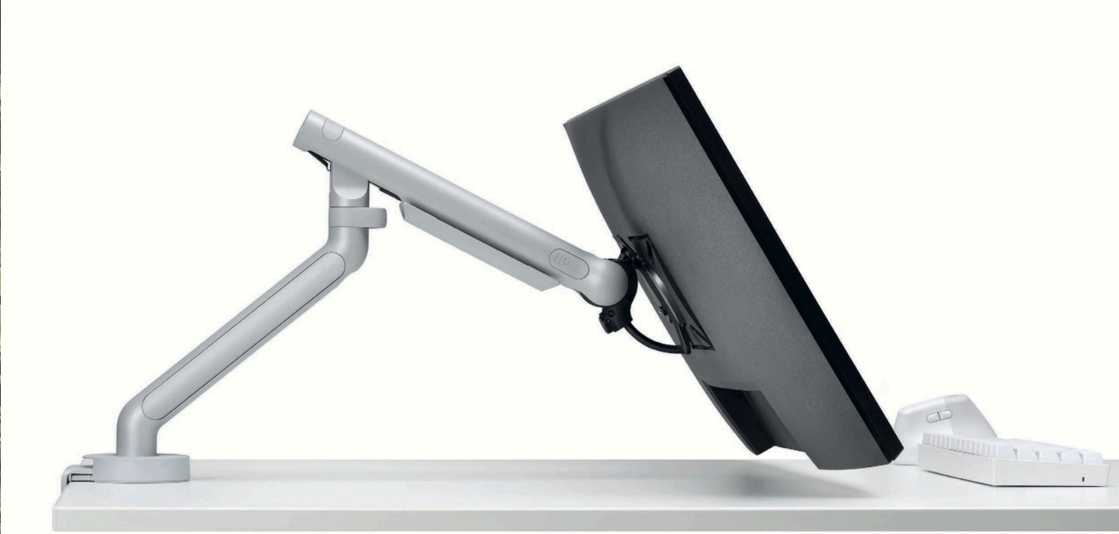
FLO IS DESIGNED TO ACCOMMODATE WITH EASE THE LATEST GENERATION OF SCREENS UP TO 34" | 7KG (15.4lb)