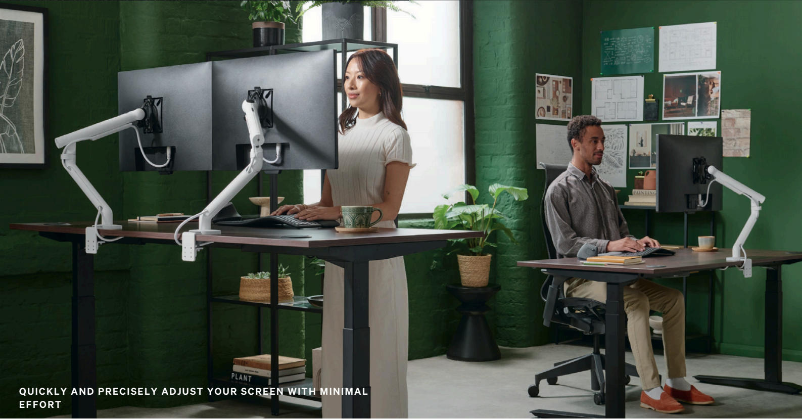
QUICKLY AND PRECISELY ADJUST YOUR SCREEN WITH MINIMAL EFFORT