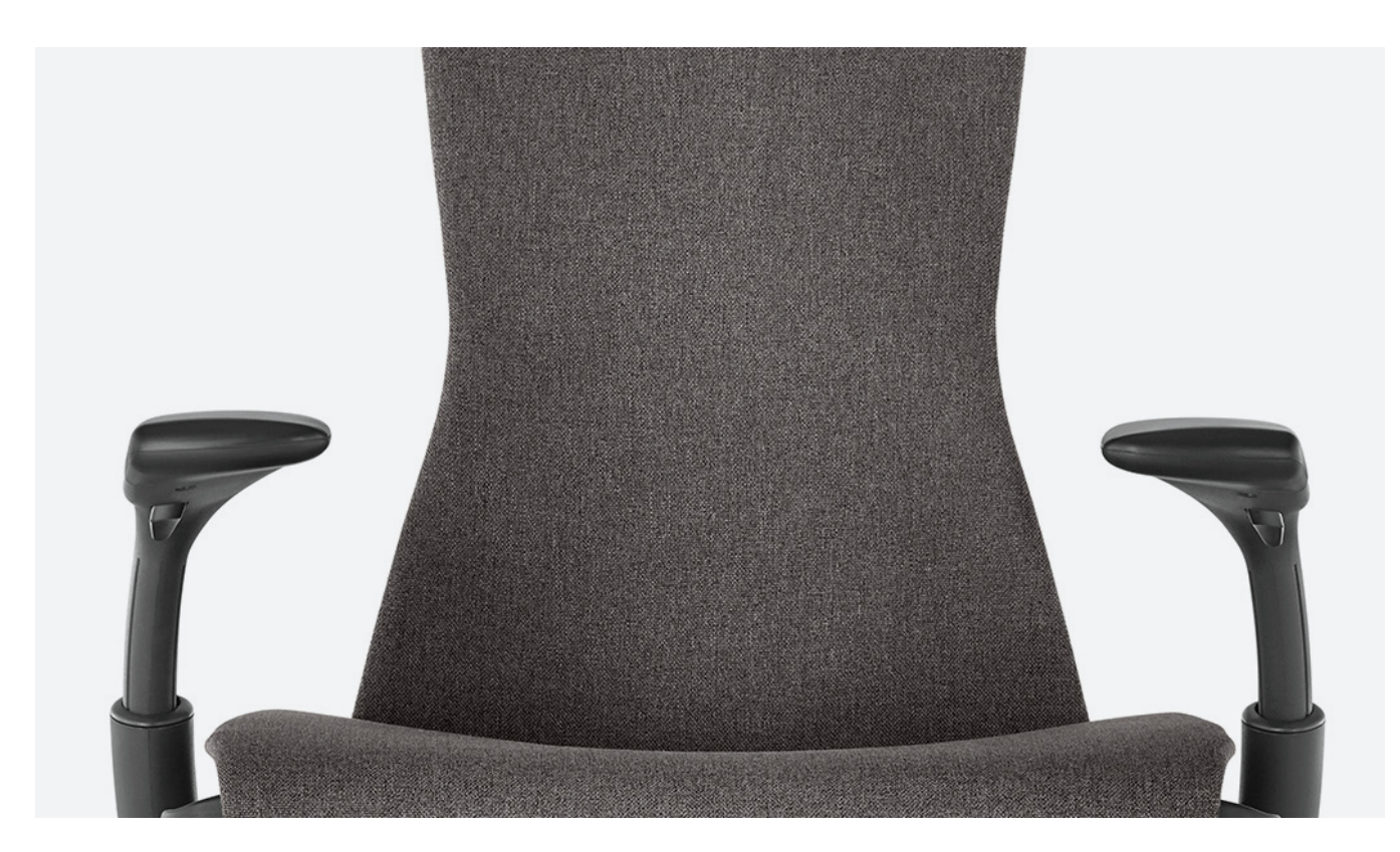
Embody's narrow backrest lets your arms and shoulders move unimpeded. This movement helps open your lungs and encourages deeper breathing and more focused thinking.