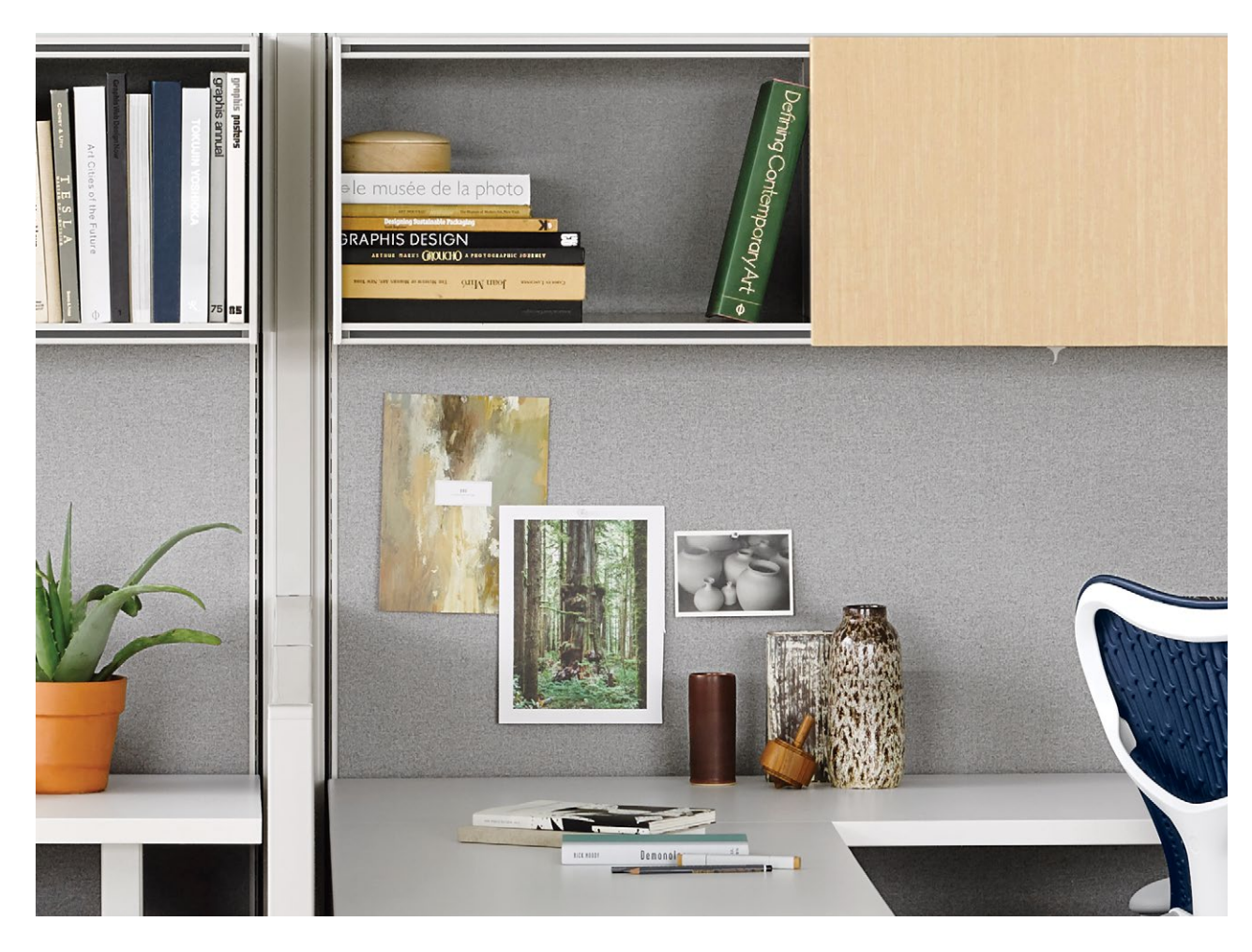
Hanging\ storage\ keeps\ a\ work space\ neat,\ and\ tackable\ panels\ offer\ plenty\ of\ space\ for\ the\ display\ of\ personal\ items.

Versatile and hardworking, Action Office offers exceptional value. It's a straightforward, hassle-free solution—easy to understand and order, quick to install, and simple to reconfigure.